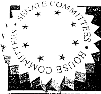
FIGURE 14-4 Standing Committees in Congress Before any bill can be considered by the entire House or Senate, it must be approved by a majority vote in the standing committee to which it was assigned. Why do you think these committees are called standing committees?

Google at least 10 committees in each House, list them.