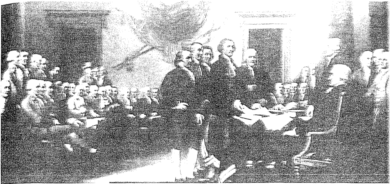
Why did colonial leaders believe a formal declaration of independence was needed?

Sovereignty in Britain rests in the British Parliament. Parliament can, as some have said, “do anything but make a man a woman.” It could, if it wished, repeal the English Bill of Rights or the remaining guarantees of Magna Carta, or in other ways change Britain’s unwritten constitution. Parliament would not likely use its sovereign power in such ways because of respect for the unwritten constitution by its members and by the British people as a whole.